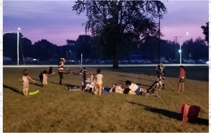
Fun with glow sticks