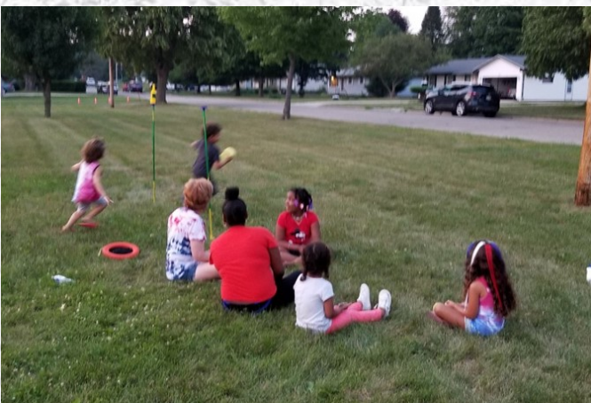
While the children played Drip, Drip, Drench!