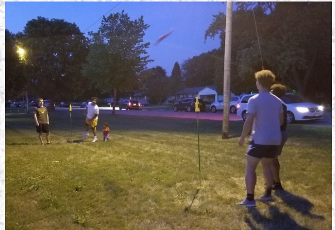
Teens played a frisbee game