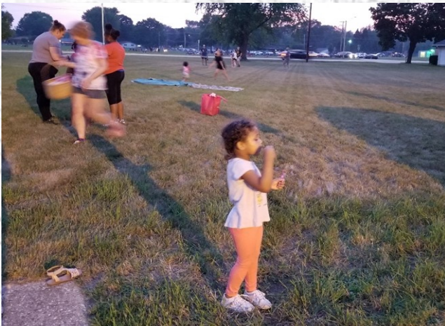
Fun with bubbles