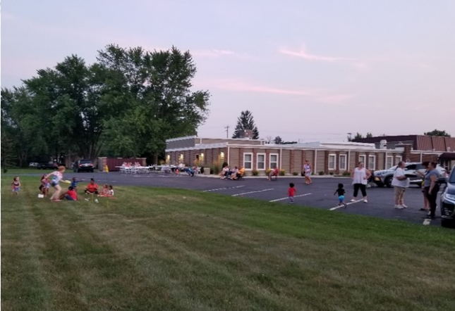
A great gathering!