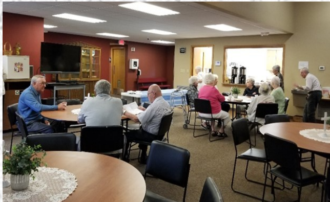
Some are gathering before Sunday worship for coffee, donuts and conversation